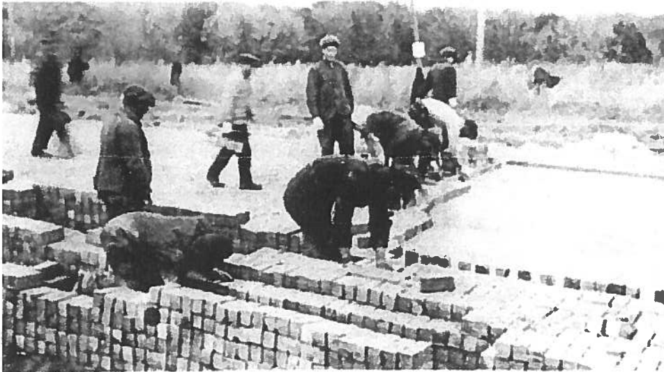
Placing monolithic brick pavement for the Des Moines to Camp Dodge road. 1917-1918